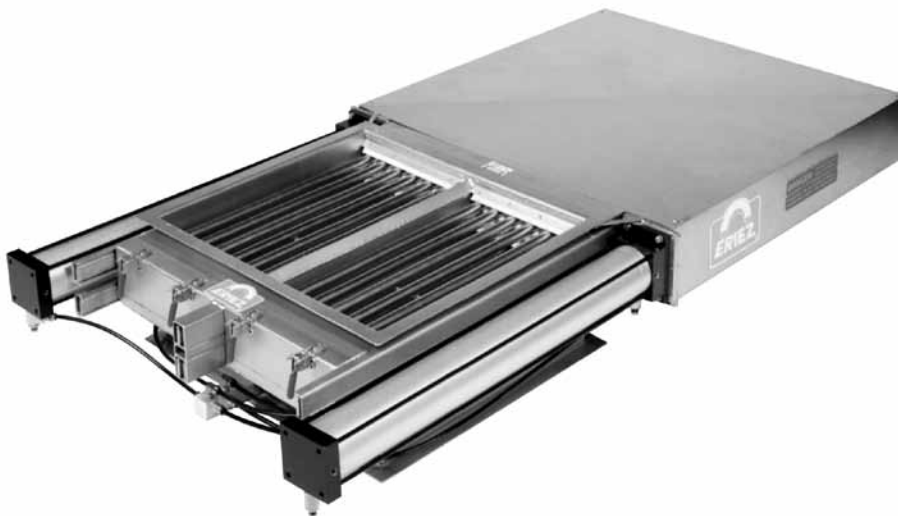
Typical Automatic Easy to Clean