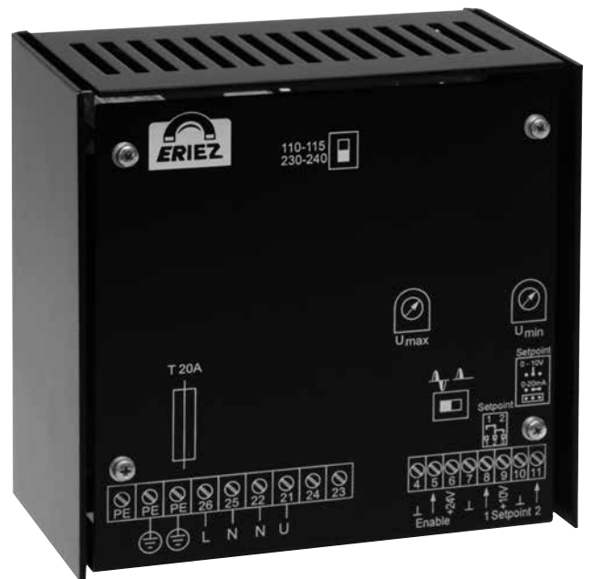
CHASSIS MOUNT UNICON CONTROL