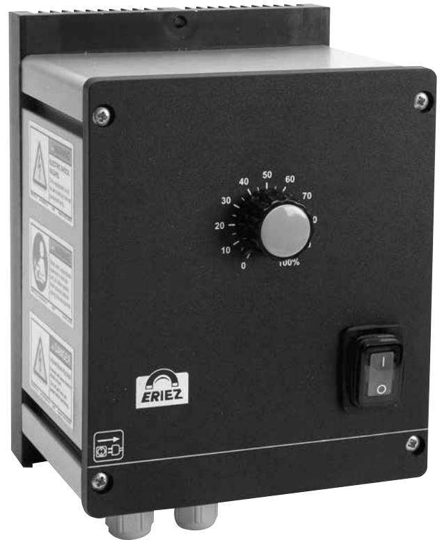
NEMA 12 UNICON CONTROL

The enclosed version includes mains input and feeder output cables. In the front panel there is a mains switch and a throughput adjustment potentiometer. The potentiometer can be used to set the feed rate from 10...100%, it's also possible to reduce the range of output voltage by using the internal Umin and Umax trimmers.