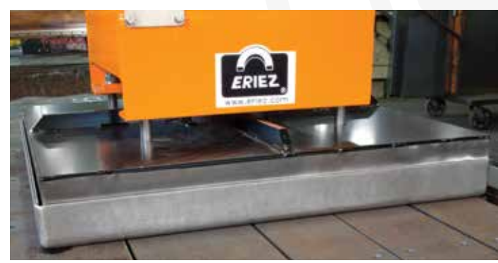
Heavy duty stripper pan for long service life