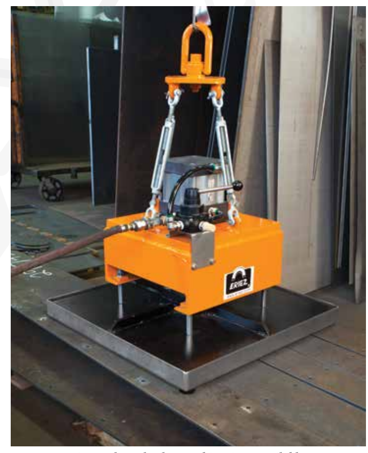
Numerous air supply and valve combinations available