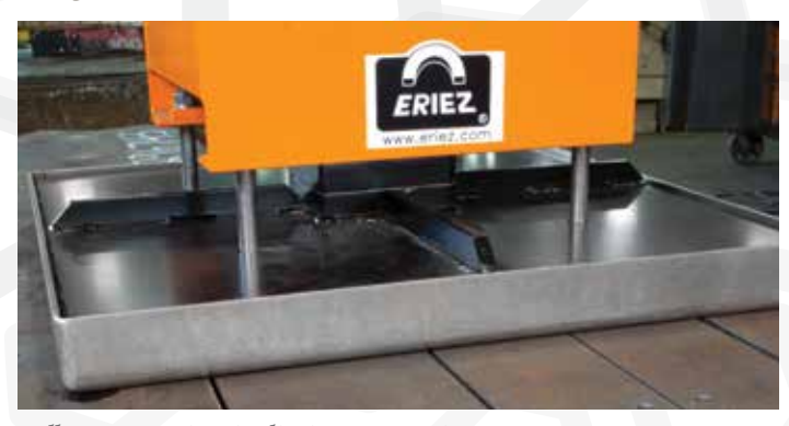
Full coverage circuit eliminates gaps in coverage