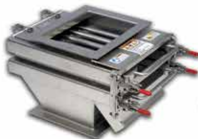
Easy-To-Clean TGH-2 Grate-In-Housing