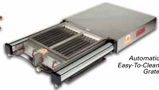
Automatic Easy-To-Clean Grate