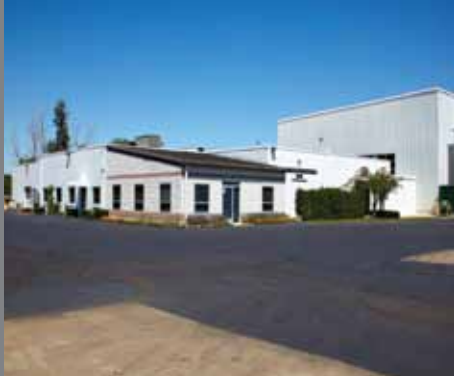
Eriez Technical Center