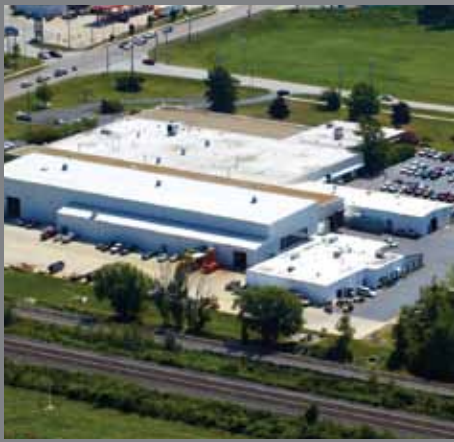
Eriez World Headquarters