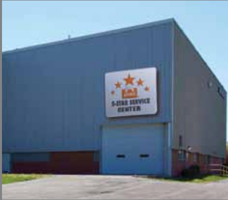
Eriez 5-Star Service™ Center