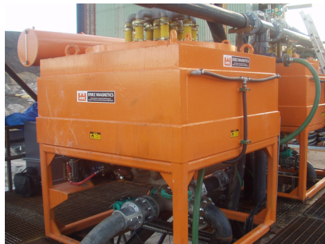
A pair of HI Filters processing sand for the glass industry

Already, Eriez has supplied a 1 Tesla (10,000 gauss) HI Magnetic Filter into Turkey. Models with 6500 gauss are commonly used in the mineral processing industry, with bore diameters of up to 1.2m.