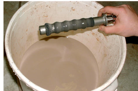
Typical iron pulled out by a HI Filter

The High Intensity (HI) Magnetic Filter is not a new concept. Indeed, various designs of the HI Filter can be found in ceramic plants across the world, purifying ceramic bodies and slips. They are even installed in chocolate plants, removing fine iron from the grinding process. What is new is how the technology is applied.