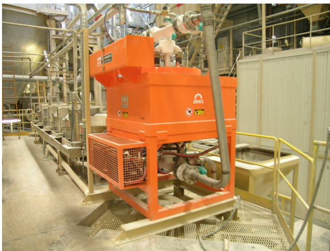
HI Filter installed at a ceramic plant

The electromagnetic HI Magnetic Filter is designed to generate and project high magnetic fields into a central column containing a magnetically susceptible matrix. Strongly and weakly magnetic particles are then attracted to and held on the matrix. The original HI Magnetic Filters had background fields of 5000 gauss and these remain best suited to the ceramic industry and removing fine iron. Development work is ongoing in the ceramics field where higher field HI Magnetic Filters are able to increase the brightness of barbotines.